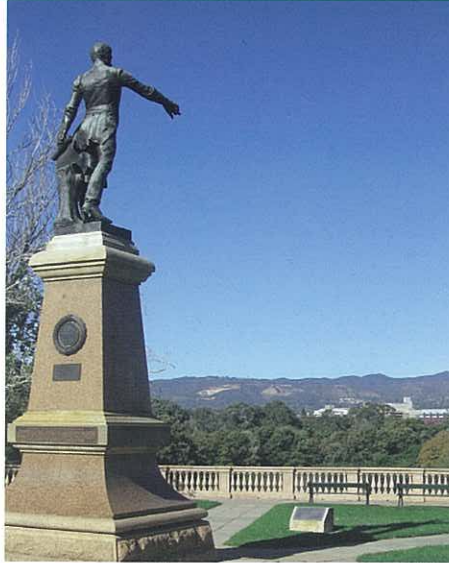
Colonel William Light, Adelaide. South Australia's tradition of strong planning continues today with a comprehensive inclusionary zoning policy

Most of the properties built to date have been for affordable home ownership not rental. Affordable sales are restricted