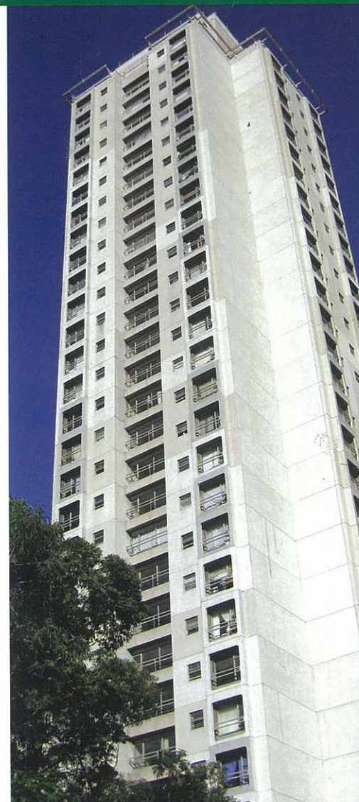
Public Housing at Waterloo, Sydney. Old style approach to affordable housing

Together with tax and GST savings and a cross-subsidy from higher income tenants, City West's financing is such that they do not need on-going subsidy to provide affordable rental housing.