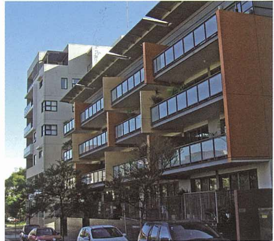
City West housing at Green Square, Sydney. Contemporary designed mixed-income neighbourhood'

Port Phillip is one of Australia's most progressive and far-sighted local councils in promoting affordable housing solutions. In 1986 the former City of St Kilda Council established a new organisation to acquire and manage affordable housing. As with City West, this was in part to mitigate gentrification. Using a mixture of State and Commonwealth grants together