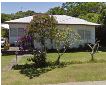
...Bangalow Road before the NCCH development.

The property was designed and built with no government funding.